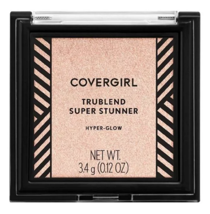
CoverGirl, TruBlend Super Stunner Hyper-Glow Highlighter